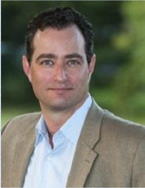
Bill Irwin Candidate for Mayor